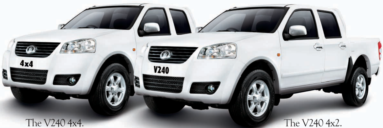
The V240 4x4.