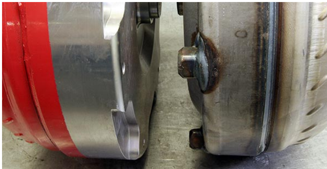
Left: Banks uses solid billet steel. Right: Stock bolt points are welded on.

The Banks Billet Torque Converter is also a smart upgrade for trucks modified for increased performance. The entire assembly is balanced and blueprinted for ultimate performance and smoothness.