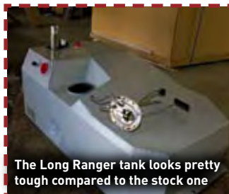
The Long Ranger tank looks pretty tough compared to the stock one