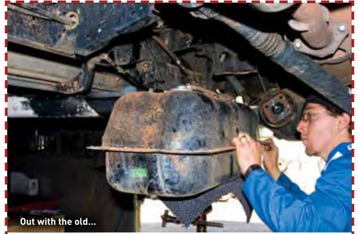
Out with the old...