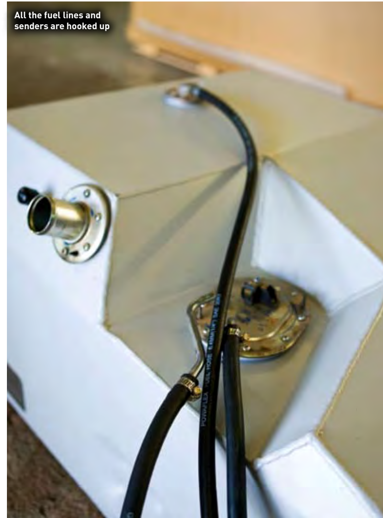
All the fuel lines and senders are hooked up