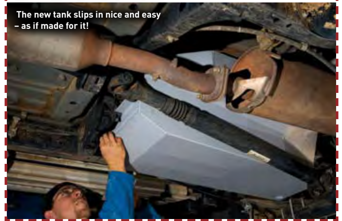
The new tank slips in nice and easy - as if made for it!