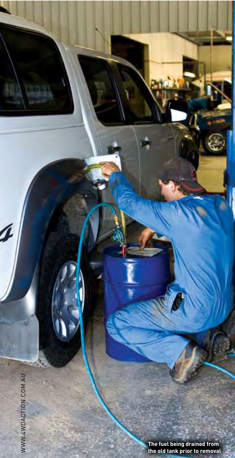
The fuel being drained from the old tank prior to removal

When it came down to choosing a long-range tank, it needed to be able to withstand a fair degree of punishment off-road, and needed to be fairly well tucked away.